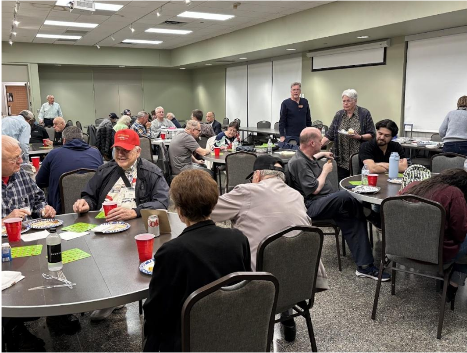
After Dinner. Getting Ready for Bingo